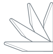
PACK OF 4